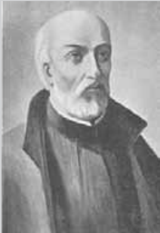
St. John de Brebeuf